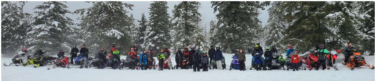
The crew. 30 riders with 15 of them under 18 years old