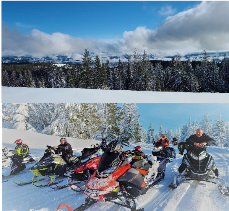
Top: Grande Ronde and Wallowa Mountains Bottom: Enjoying bluebird skies