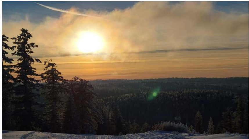
Amazing Sunset on 12-12-20

flakes make their way down. May each of you be blessed this Christmas Season with health, safety and quality family time. I hope each of you can reflect on the true meaning of Christmas this year and be able to share it with your families. May you experience true joy and light.